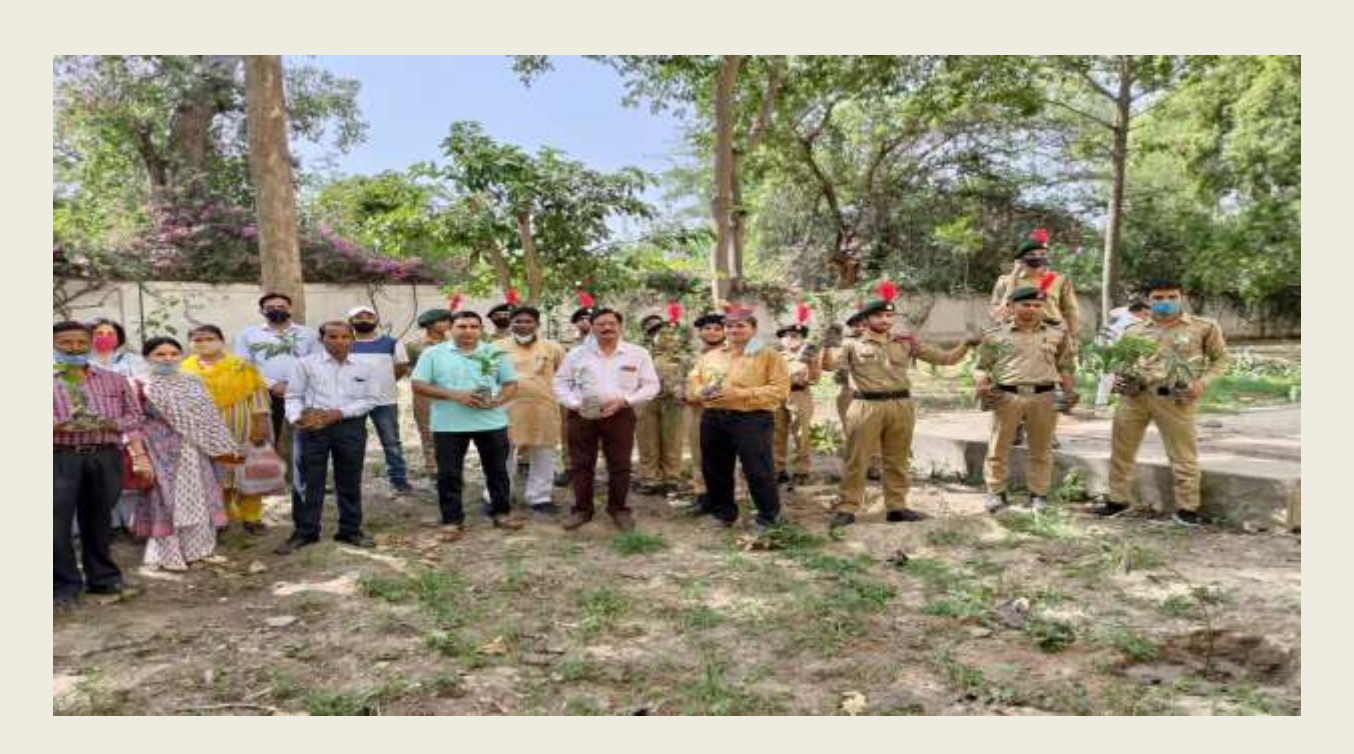
Plantation Drive in College