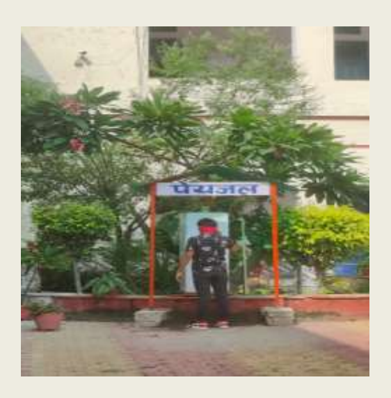
II. Book Bank Facility: Students can get three books from the library at one time and then return those and get new books issued.

I. Drinking Water Facility : There are five submersible pumps installed in the college building and 07 water coolers and 8 R.O. and one water purifier of 200 L capacity for drinking water.